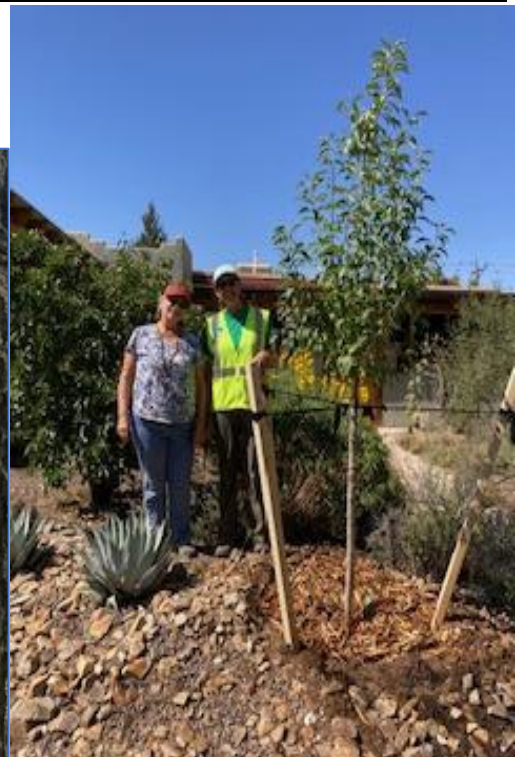
Fruitless Crabapple Tree